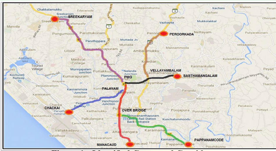
Figure 1: Identified Congested Corridors

As the central area houses numerous traffic generators, high incidents of congestion is witnessed and hence it is the need of the hour that road pricing should be implemented in the city. Supply of road infrastructure is not sufficient to meet demand levels to a given level of service. Eventhough there are various indices to identify congested areas, the method of Travel Time Index was used. Travel time was assessed on major road corridors in the city area, which were primafacia considered as the congested corridors as per the past traffic data available. Accordingly detailed investigation was carried out in these road corridors.