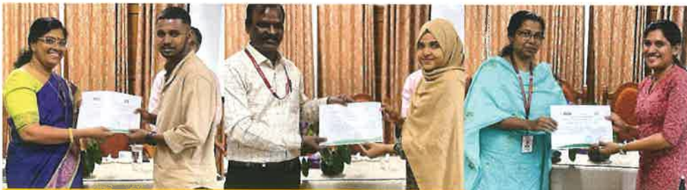
Certificate distribution to the participants